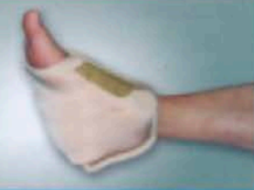
DERMASAVER STAY-PUT HEEL PROTECTOR